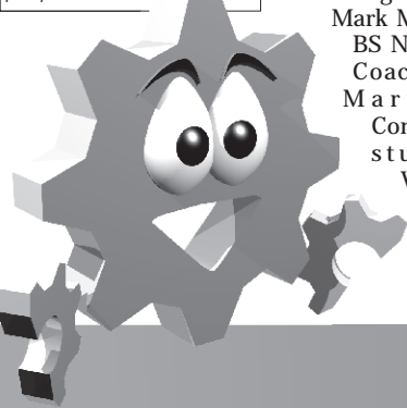
UC's Winning Mascot "Gearo" symbolizes the Filipino's untapped potentials.

Baguio and Benguet last July 24 at the Baguio Convention Center. They also garnered the Best Oral Defense Award.